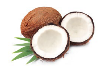
MCT OIL Caprylic/capric triglyceride

Ingredients: CAPRYLIC/CAPRIC TRIGLYCERIDE, CANNABIS SATIVA BIOMASS EXTRACT