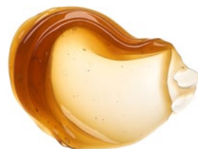
HEMP EXTRACT Cannabis sativa L.