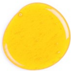
COD LIVER OIL

Ingredients: COD LIVER OIL, HEMP BIOMASS EXTRACT