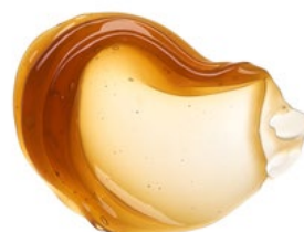
HEMP EXTRACT Cannabis sativa L.