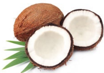
MCT OIL Caprylic/capric triglyceride