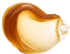
HEMP EXTRACT Cannabis sativa L.

Ingredients: AQUA, PRUNUS AMYGDALUS DULCIS OIL, HAMAMELIS VIRGINIANA LEAF WATER, ARGANIA SPINOSA KERNEL OIL, COCOS NUCIFERA OIL, BUTYROSPERMUM PARKII BUTTER, CETEARYL ALCOHOL, CETEARYL GLUCOSIDE, GLYCERIN, PANTHENOL, TOCOPHERYL ACETATE, GLUCONOLACTONE, SODIUM BENZOATE, CANNABIS SATIVA LEAF EXTRACT, VANILLA PLANIFOLIA FRUIT EXTRACT, HELIANTHUS ANNUUS SEED OIL, CETYL ALCOHOL, BENZYL ALCOHOL, DEHYDROACETIC ACID, UBIQUINONE, ALLANTOIN, XANTHAN GUM, SODIUM ASCORBYL PHOSPHATE, PARFUM, LINALOOL, D-LIMONENE, CITRONELLOL, CITRAL, GERANIOL