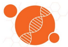
SOLUBLE COLLAGEN Collagen