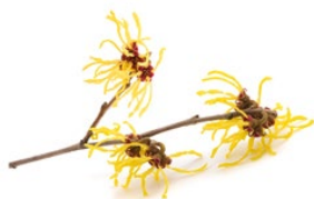
WITCH-HAZEL LEAF HYDROLATE Hamamelis Virginiana Leaf Water