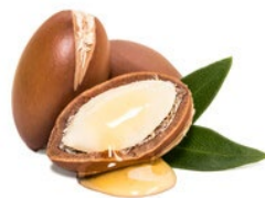
ARGAN OIL Argania spinosa L.